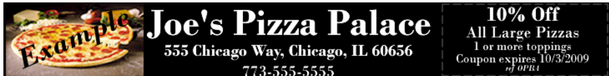
“Pinned Banner at High Traffic Location - logo dimensions (728px width by 90px height)”

The Grand Slam Sponsorship offers our most robust sponsorship level with a “pinned” aka permanent banner positioned at a high traffic page (first come first serve) along with random private page banner circulation and more.